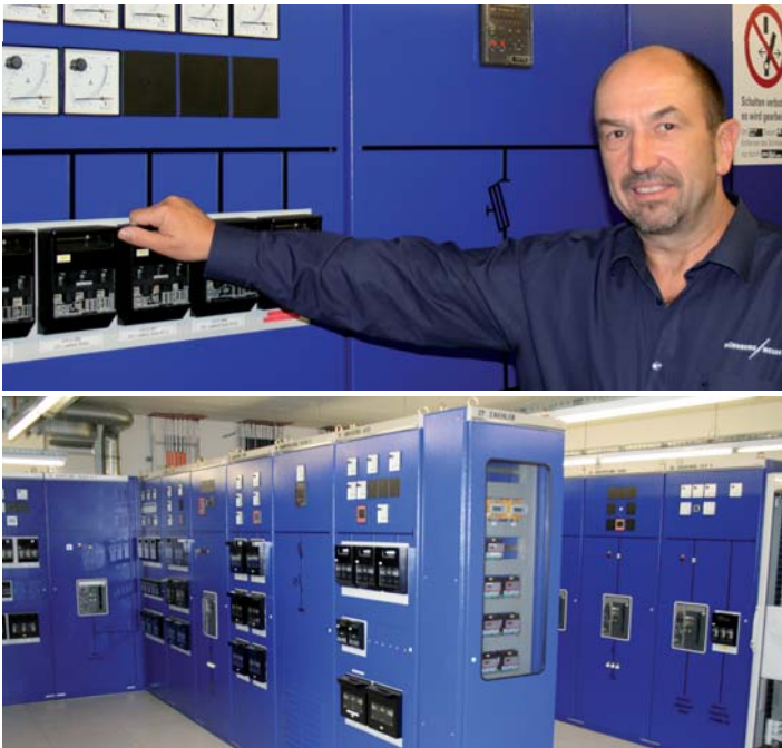
Electrical installation at NürnbergMesse

▶▶▶ Due to the size and structure of the entire site, it is no longer feasible to have our technical staff conduct checks as part of routine patrols in order to stay on top of things.